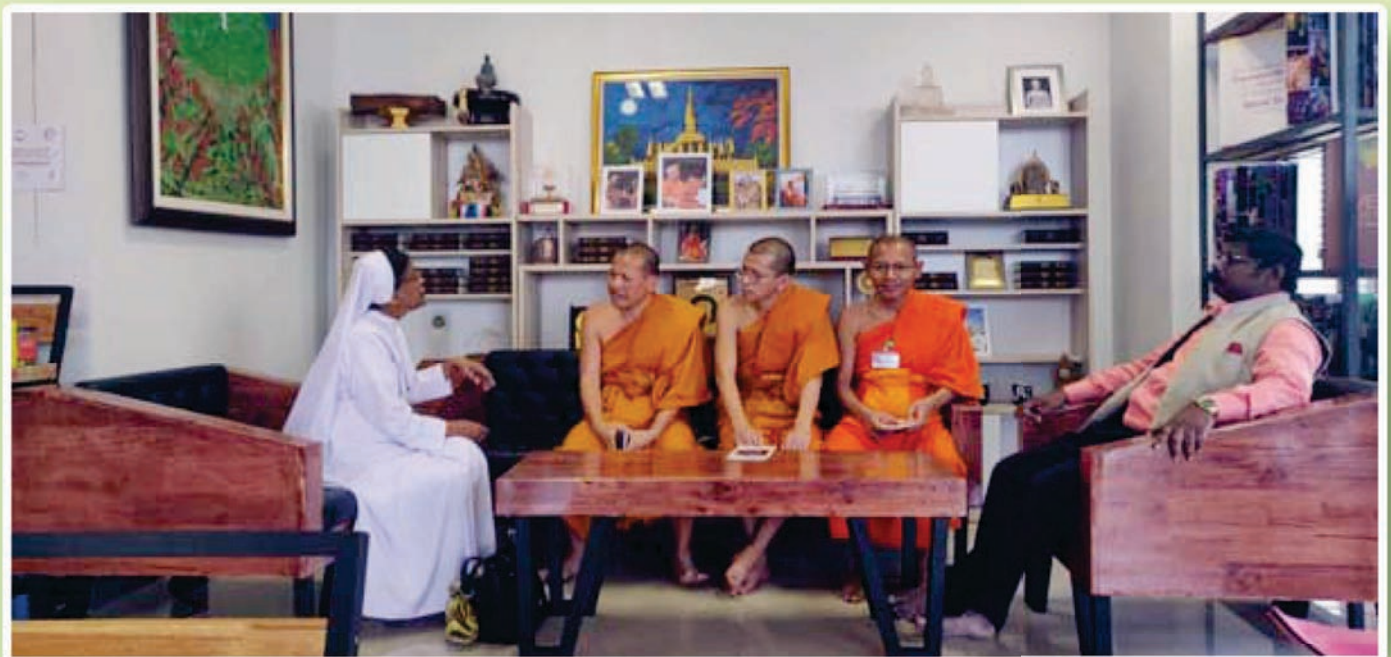
Principal's Interaction with the Director and authorities of the Buddhist CENTRE

The group checked out from the hotel after having breakfast and started for the International Buddhist Studies College (IBSC) – A graduate college of Maha Chulalongkorn raja vidyalaya University that provides an opportunity to pursue research in Buddhist studies.